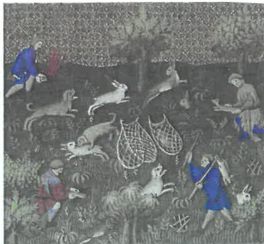
MEDIEVAL RABBIT FARMING