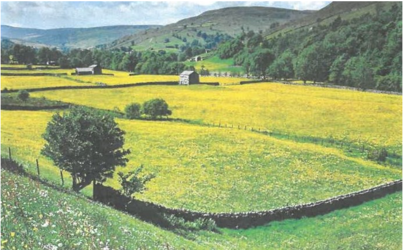
Muker Meadows, Swaledale

07:20 Tattersett Manor Farm ( Alastair Wagg ), off A148 between the Sculthorpe Straight and East Rudham, PE31 8RS