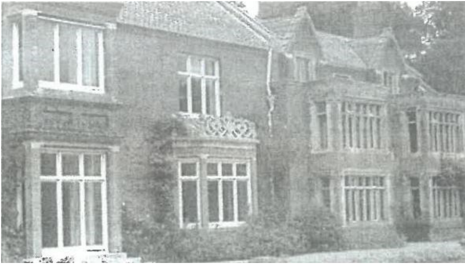
BURGY OLD HALL