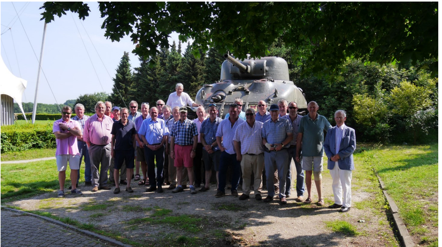
ON TOUR IN HOLLAND 2018