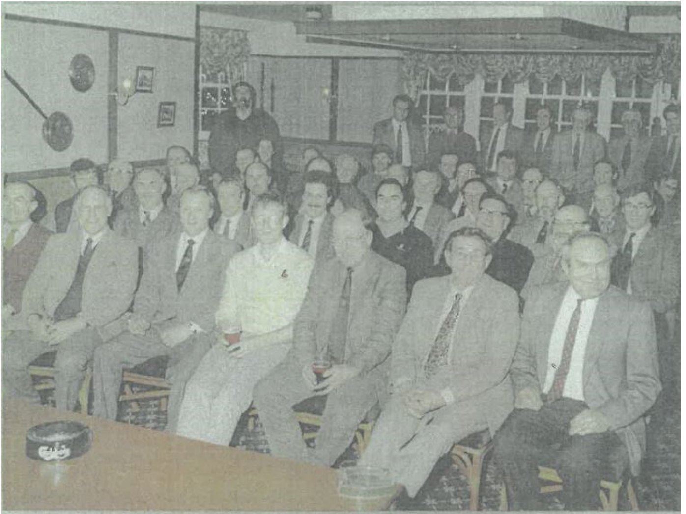
HOLT FARMERS CLUB 1989