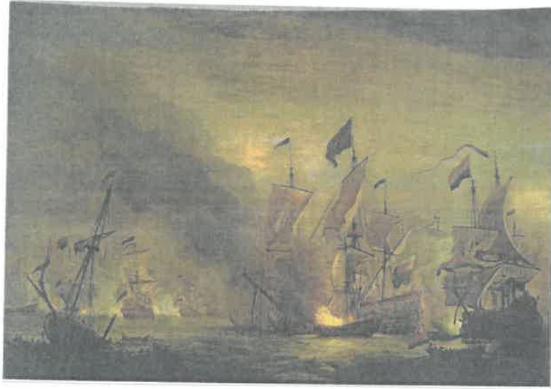
The Battle of Sole Bay 1672

Suffolk Coastal was the constituency held by John Selwyn Gummer when he was MAFF Secretary and a good negotiator around the time of the MacSharry reforms. As Lord Deben he has moved towards the Monbiot camp while Therese Coffey, the beleaguered DEFRA Secretary, is now the local MP. The Greens are strong in Suffolk concentrating on local issues and, in May, Mid Suffolk became the first local authority they have ever controlled. Sizewell C is further down the coast and The Greens are challenging the approval that was granted last year. The drama has also been offshore in the 1672 Battle of Sole Bay, familiar to some of us through the Adnams Broadside bitter that was introduced 50 years ago to commemorate the 300 th anniversary. Our friend Willem van de Welde the Elder was the official artist for the Dutch Fleet who captured the scene of the narrow Dutch victory; he subsequently entered into the service of Charles II and lived in London for the rest of his days. Incidentally the name Bavent derives from a feudal award in the fourteenth century to a Norman nobleman from a small place between Caen and Sword Beach which was another troublesome coastal encounter for our men.