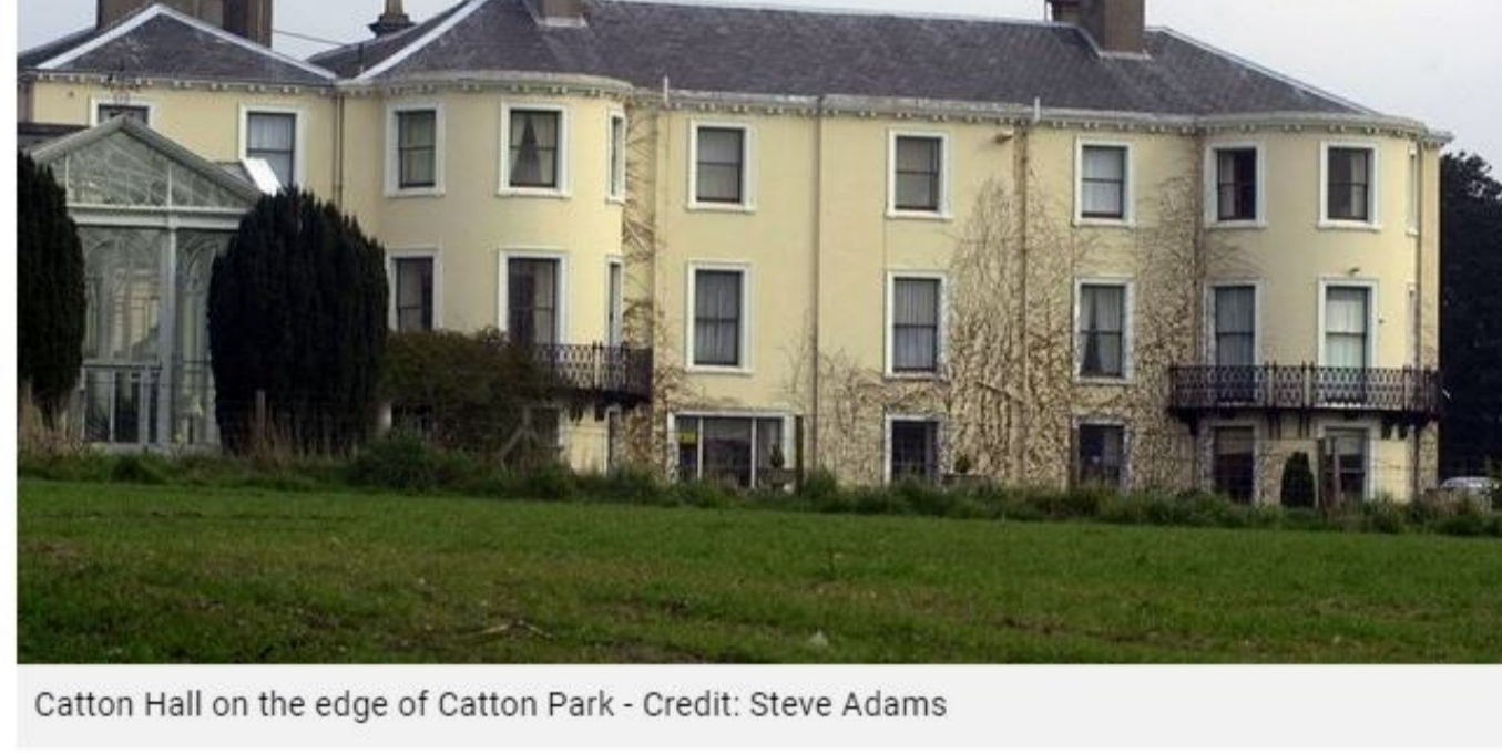
Catton Hall on the edge of Catton Park

Catton Park, which is intertwined with the 200-history of Catton Hall on the edge of the open space, was opened to the public for the first time in October 2007.